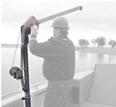
Davit (Manual or Electric)