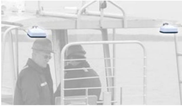
Rear Work Lamps