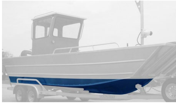
Anti-Foul Hull Paint