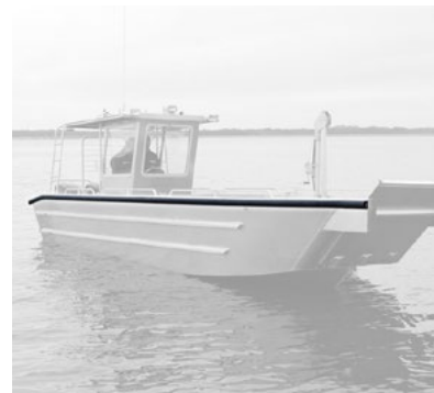
"D" Bumper Rub Rails