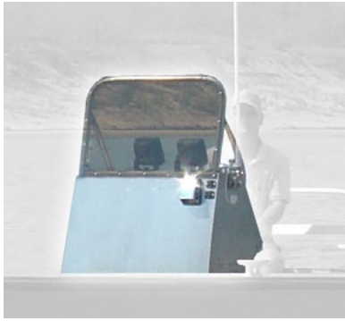
Console with Windshield