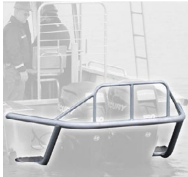
Stern Guard with Step Plate