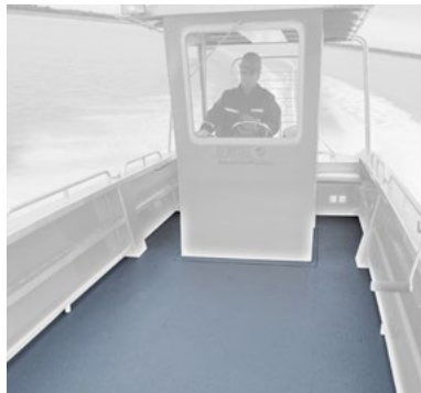
Non-Skid Deck Paint