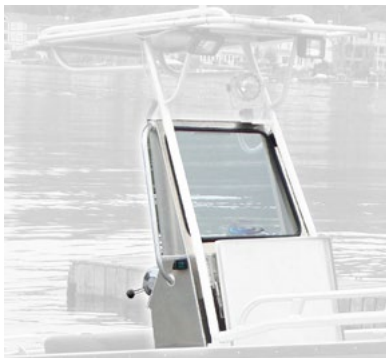
Console with Windshield and Grab Handles