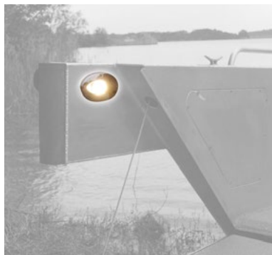
Forward Docking Lamps