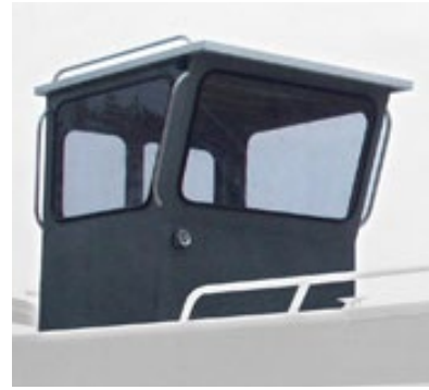
Fully Enclosed Wheelhouse