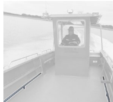
Lower Deck Railing