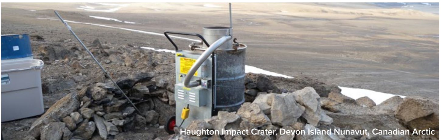
Haughton Impact Crater, Devon Island Nunavut, Canadian Arctic