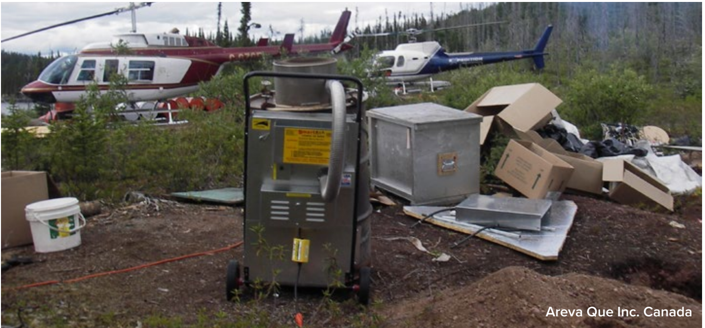
Areva Que Inc. Canada