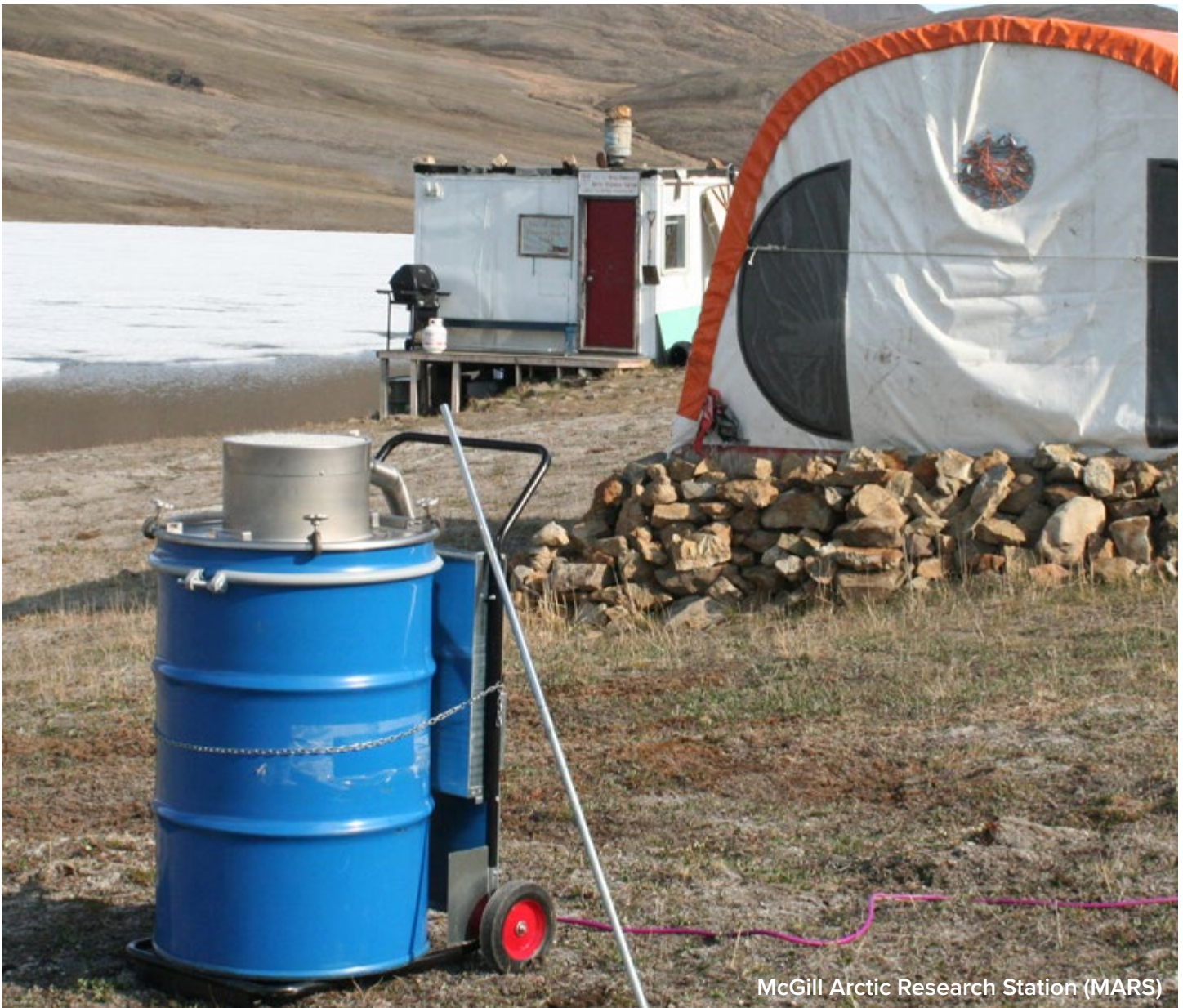
McGill Arctic Research Station (MARS)

Portable Incinerator Technical Description