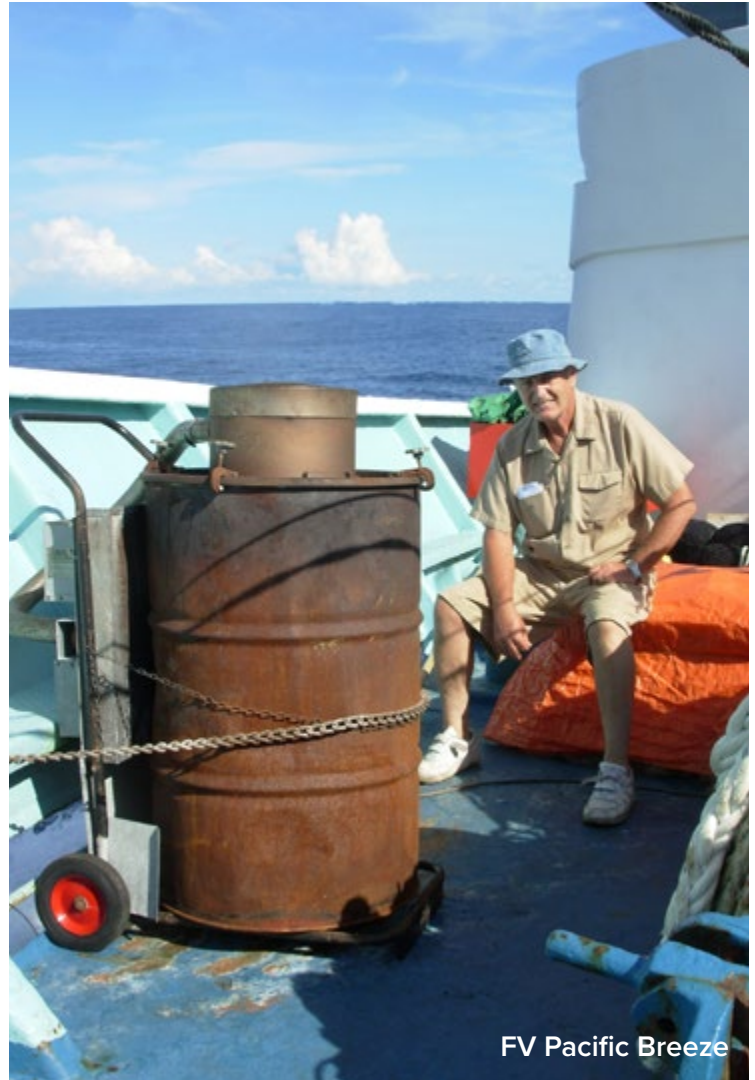
FV Pacific Breeze

Incineration is a waste treatment process that involves the combustion of organic substances contained in waste materials. Incineration and other high-temperature waste treatment systems are described as “thermal treatment”. Incineration of waste materials converts the waste into ash, flue gas and heat. The ash is mostly formed by the inorganic constituents of the waste.